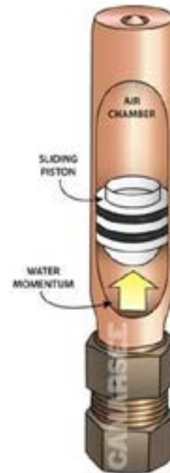
Water hammer arrestor section view

The barber shop that I patronize had a water hammer problem that was difficult to resolve. Since a backflow preventer and pressure reducing valve had recently been installed, the plumber recommended a water expansion