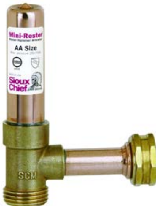
Washing machine water hammer arrestor

water pipe and fittings pressure rating and cause water leaks. A plumbing device called a water hammer arrestor (shockstop) or an air chamber is often installed on the cold and hot water lines adjacent to the fast closing valve to prevent the water hammer and its associated noise. These devices function like a shock absorber on a car to dampen the pressure wave that causes the water hammer noise.