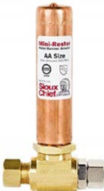
Water hammer arrestor external view

So, if you hear a water hammer noise at home, install a washing machine box or icemaker water hammer arrestor available at your local big box retailer. The YouTube website has an installation video if the instructions with the device are not clear.