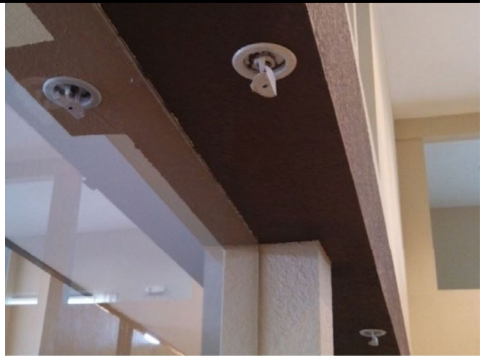
Incorrect installation: Wrong spacing on heads, 1/8" thick glazing, no window gasket & combustible window frame?

The types of glass that are allowed are as follows: