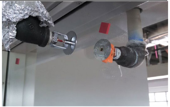
Correct installation with heads on both sides of glass

The heads are designed to be located no closer than 6'-0" apart to prevent one head from “cold soldering” or spraying the adjacent sprinkler head and keeping it from “going off”. If the heads are closer than 6'-0", a baffle is required to separate the heads to prevent the