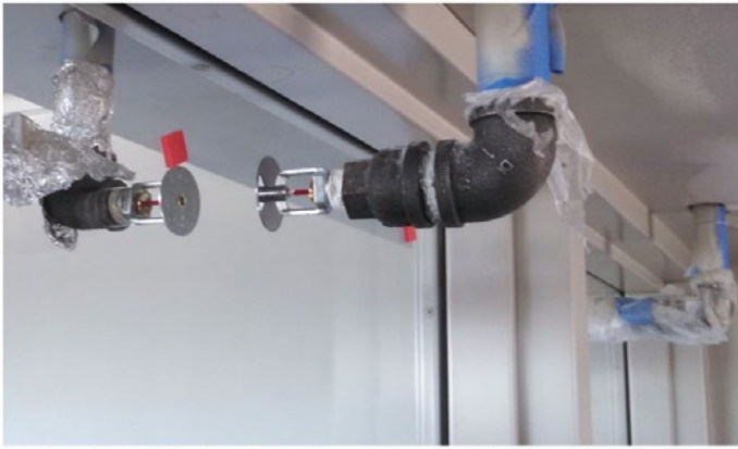
Correct installation: Sprinkler head at each window on both sides of glazing (sprinkler pip and fittings to be painted at a later date)