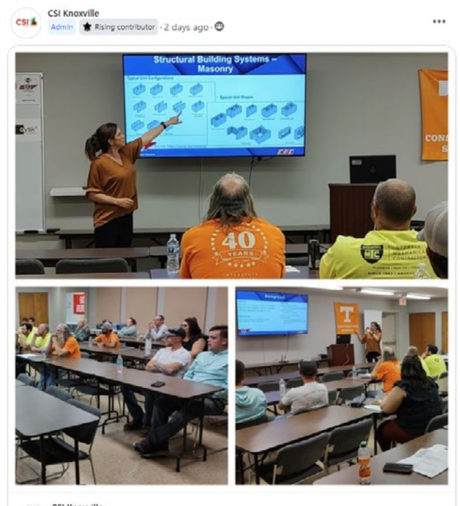
CSI Knoxville 2 days ago · C A few pictures from yesterday's structural print reading class!