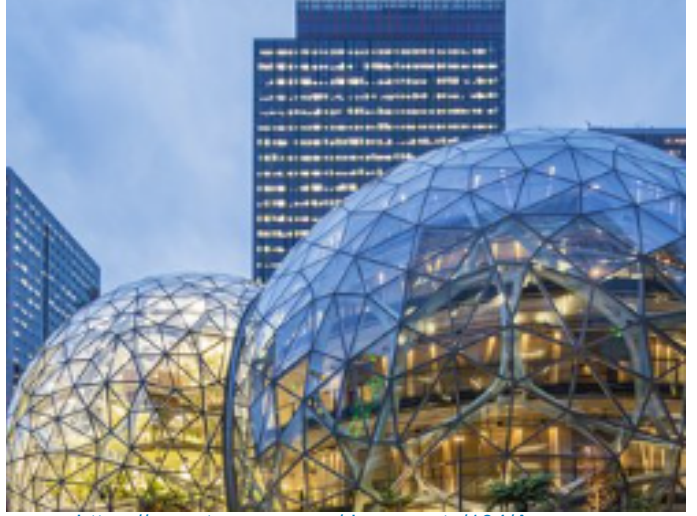
https://www.tnemec.com/documents/104/Amazon Spheres 2018.pdf