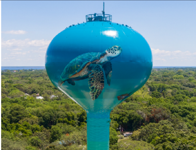
https://www.tnemec.com/documents/1051/Project-Profile-Destin Water Tank 2020 TOTY.pdf