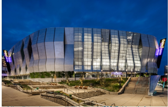
https://www.tnemec.com/documents/599/Golden 1 Arena Profile.pdf