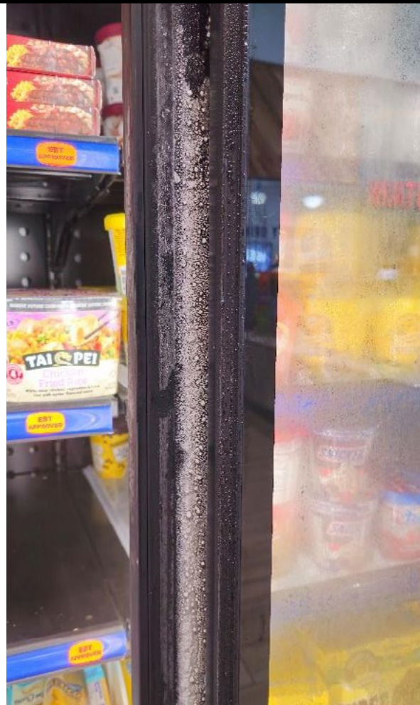
CONDENSATION ON DOOR GASKET #1

The HVAC units were originally specified as 8 ton capacity units, but 10 ton units were installed due to supply chain issues. One of the HVAC units was short cycling and the unit was not de-humidifying correctly. Condensate drain arrangement is suspect and if the