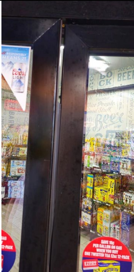
MISALIGNED BEER CAVE DOORS AND BROKEN GASKET

hold more water vapor, so RH decreases. Conversely, as temperature decreases, air becomes wetter and RH increases. This relationship is inversely proportional.