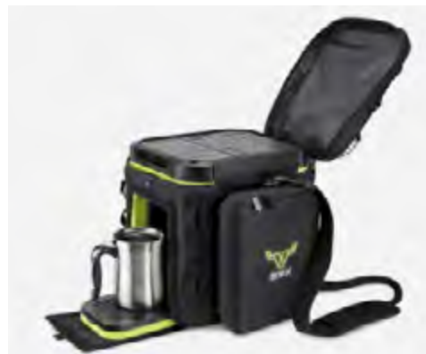
Field Case in Special Ops Black